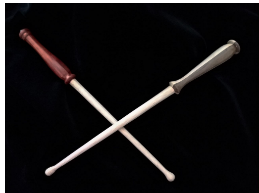
And she says They Work!