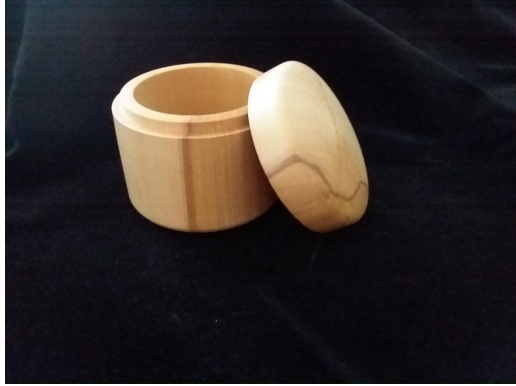
Ivory Salt Box