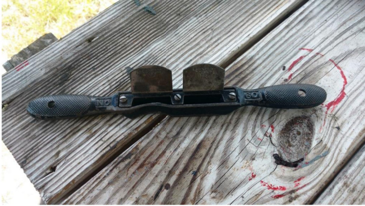
Stanley Double Spoke Shave