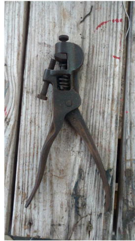
Saw Tooth Setter