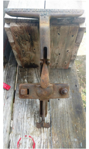
Diston Saw Vise