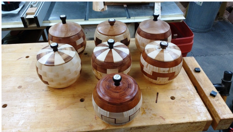
The Finished Product - 7 Beads of Courage Bowls