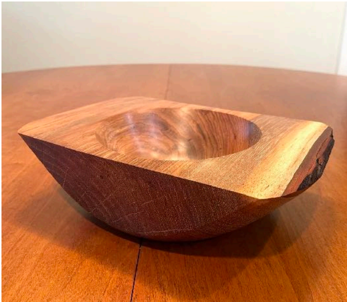
Pecan or Peecun or is it Pacaun