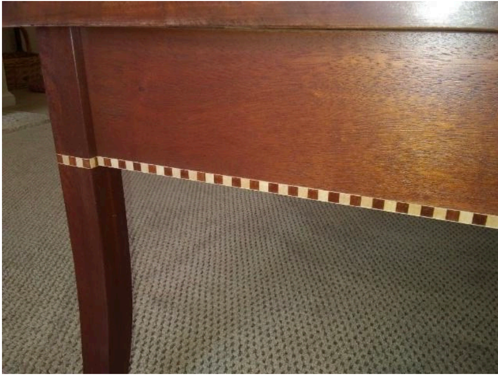
Charles shows off his Mahogany cocktail table with maple inlay and dental inlay around bottom edge. Pretty impressive.