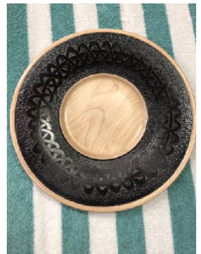
Barb really showed her stuff with these two Irish Textured Plates.