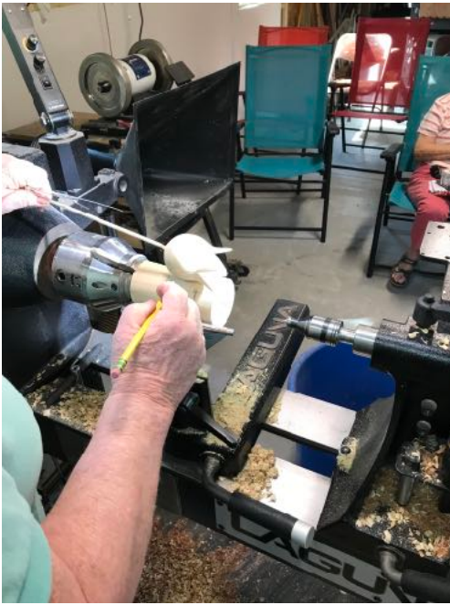
Starting out tracing a flower