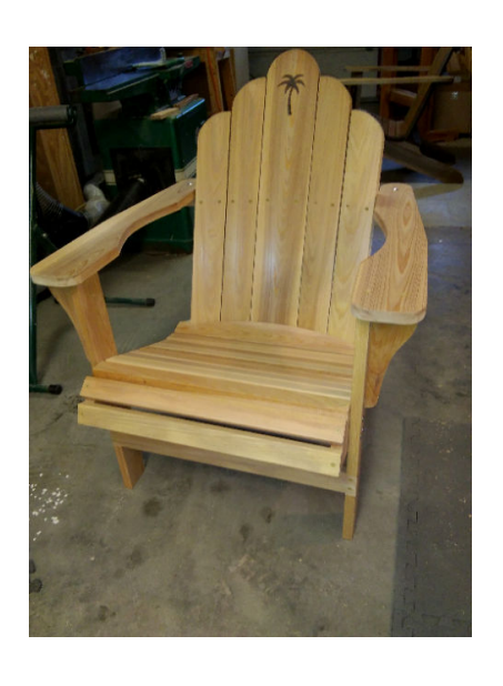
Cypress Adirondak Chair