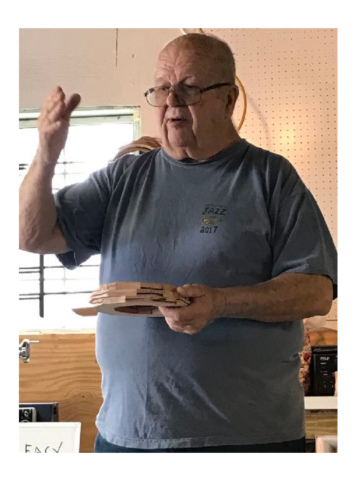
Showing the idea of graph paper with design entered.