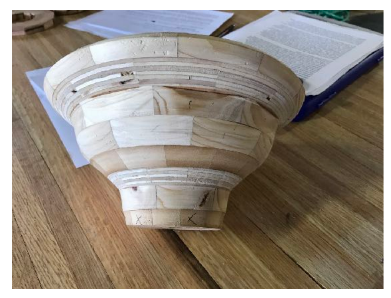
First bowl built of junk Segmented collars in oak