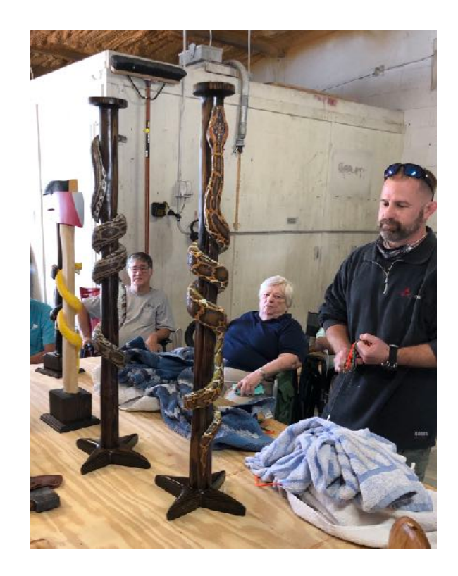
A single piece of wood turned down from 5 or 6 in to these slithery critters. Amazing \, It defiantly is a work of passion and time