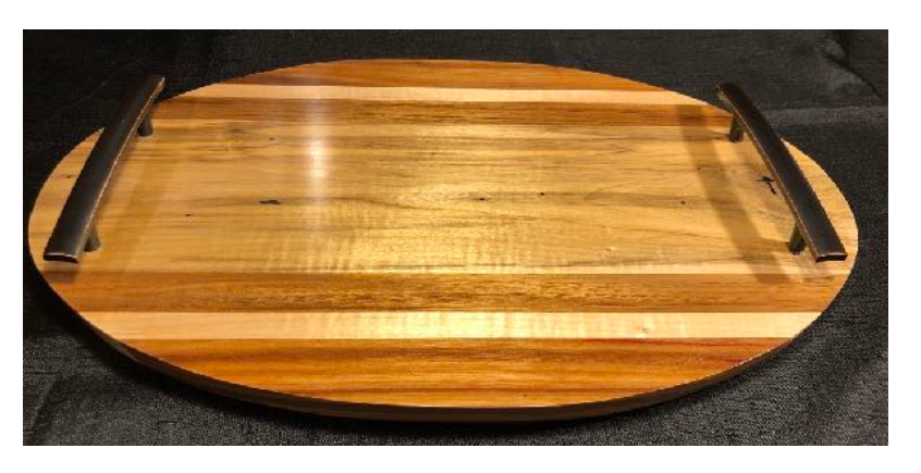
Oval tray Ambrosia maple, Canary, B Walnut and maple