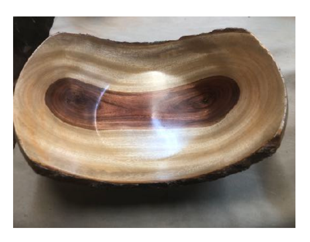
Two Camphor dishes top one is 7" x 3" Urethane Semi gloss