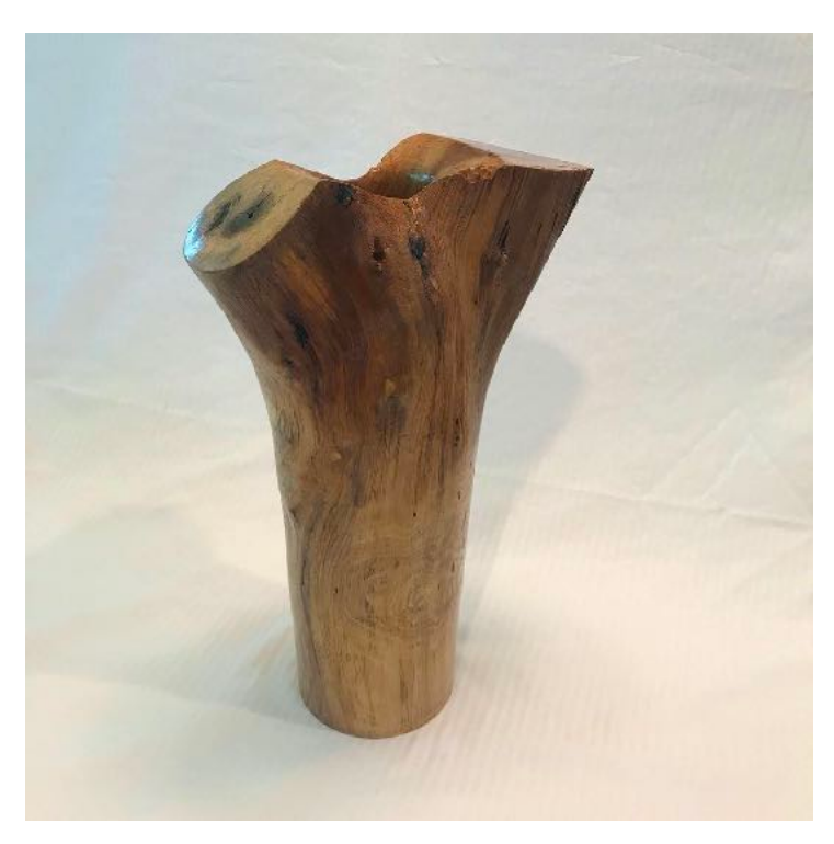
Magnolia wood bowl and a mystery wood vase