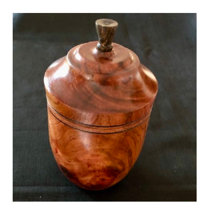
cuban mahogany,,, wood picked up at Man O War Cay Bahamas