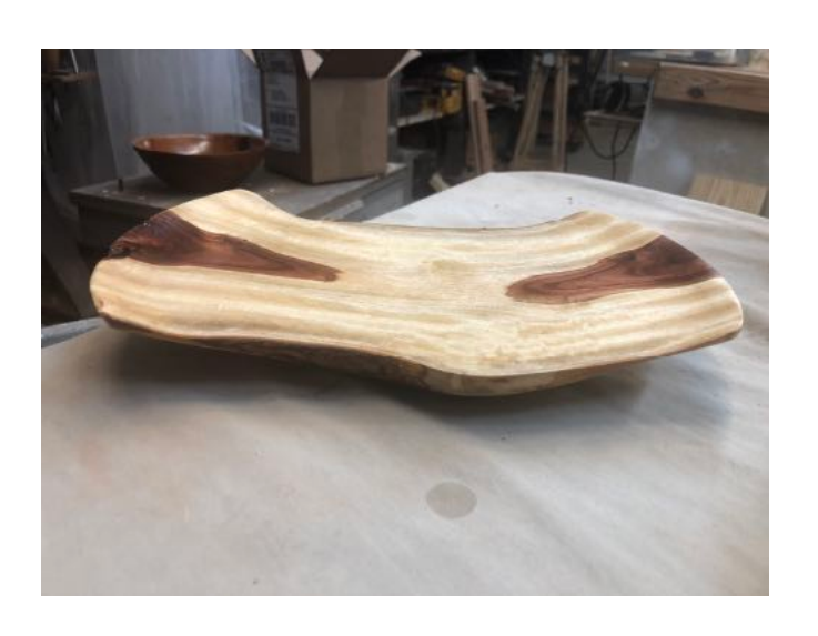
This dish is almost flat very little dish shape.. 11.5" x 7" Natural edge