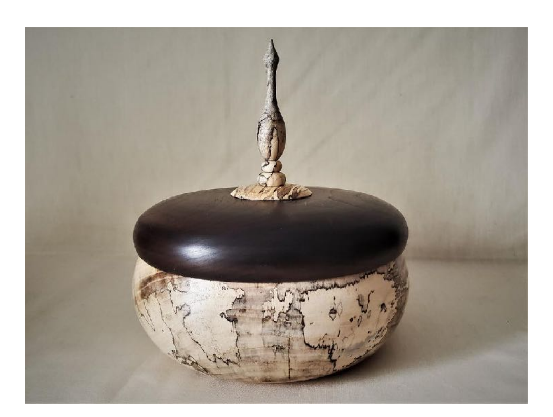
Spalted hackberry with lidded top Beautiful