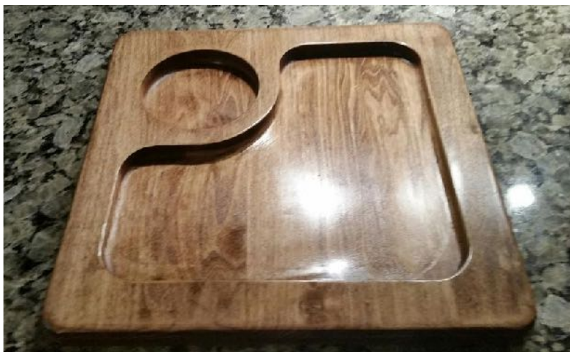
maple stained tray