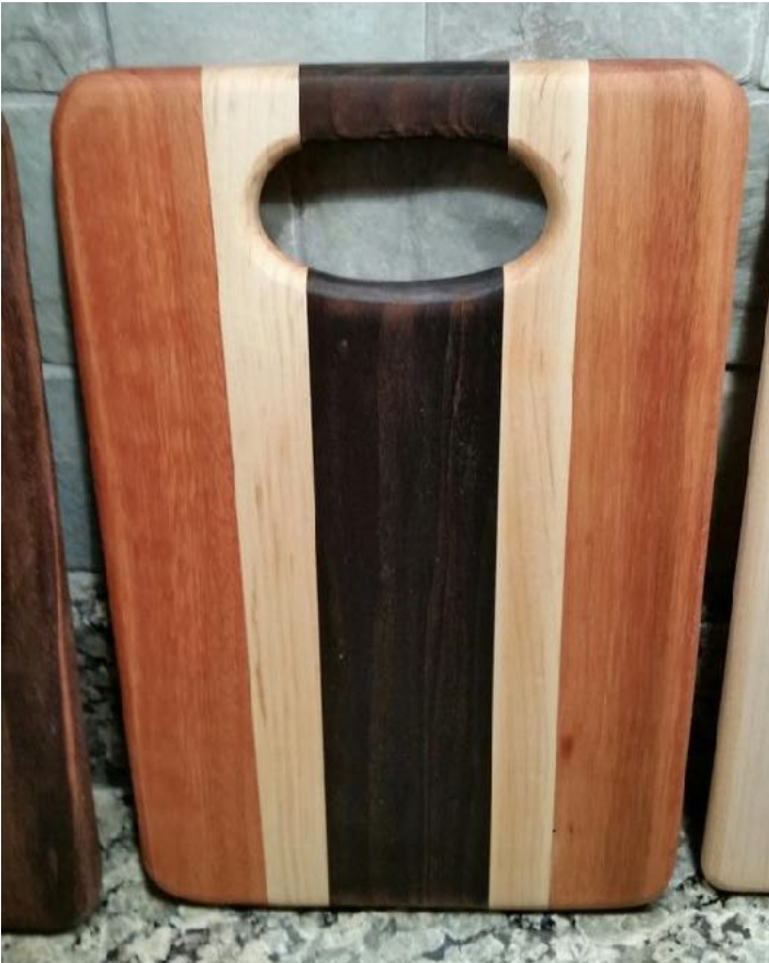
medium sized cutting boards 13x9 from scrap wood