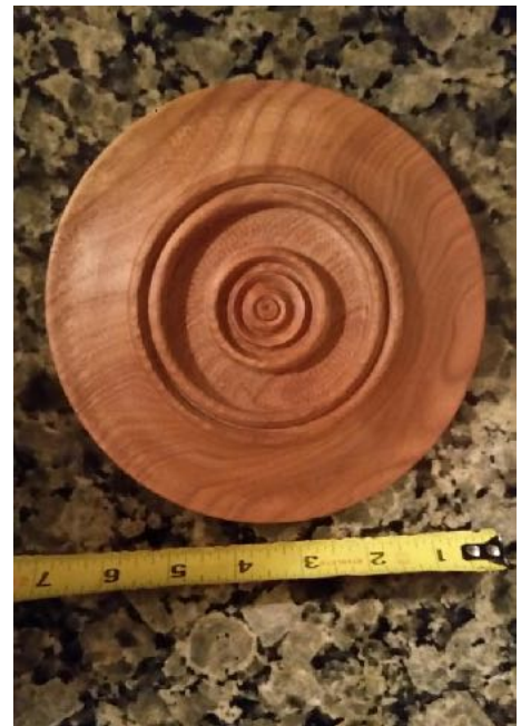
Penny sized cut outs from 1x6 in board