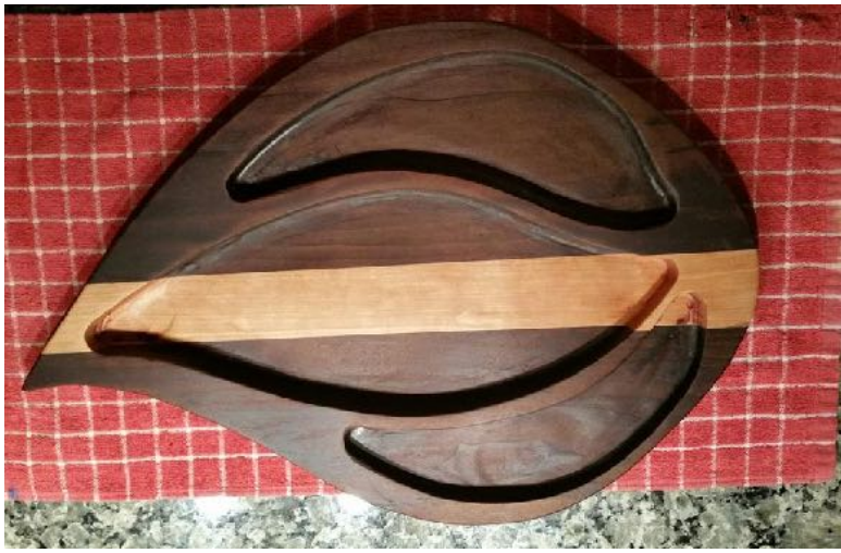
19" x 12" Viking tray made of Poplar and cherry