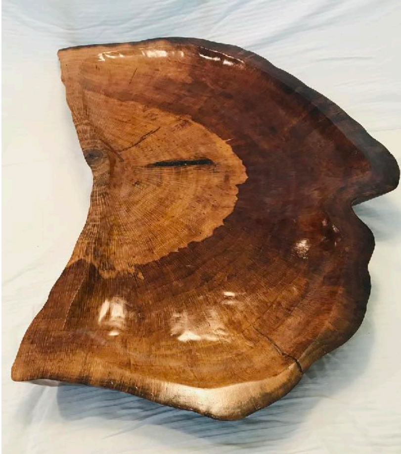
Oak tray for Low Country Boil. Walnut oil & waterlox finish