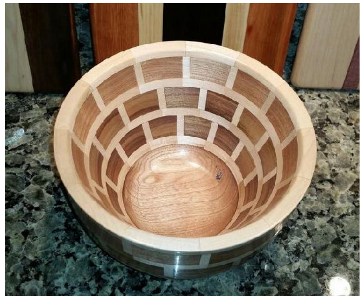
8 in segmented walnut maple bowl