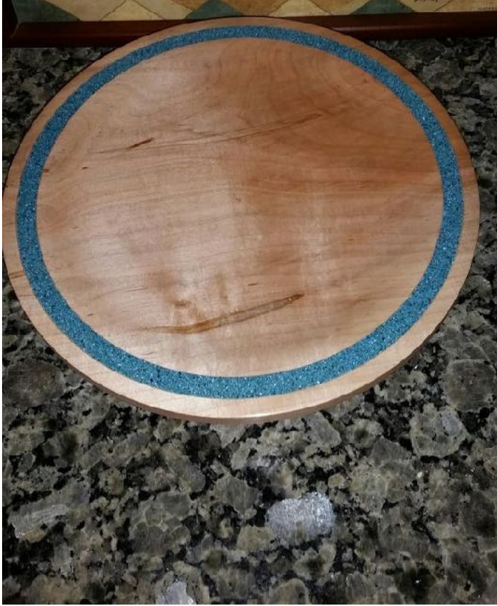
12 in spalted maple platter with turquoise inlay