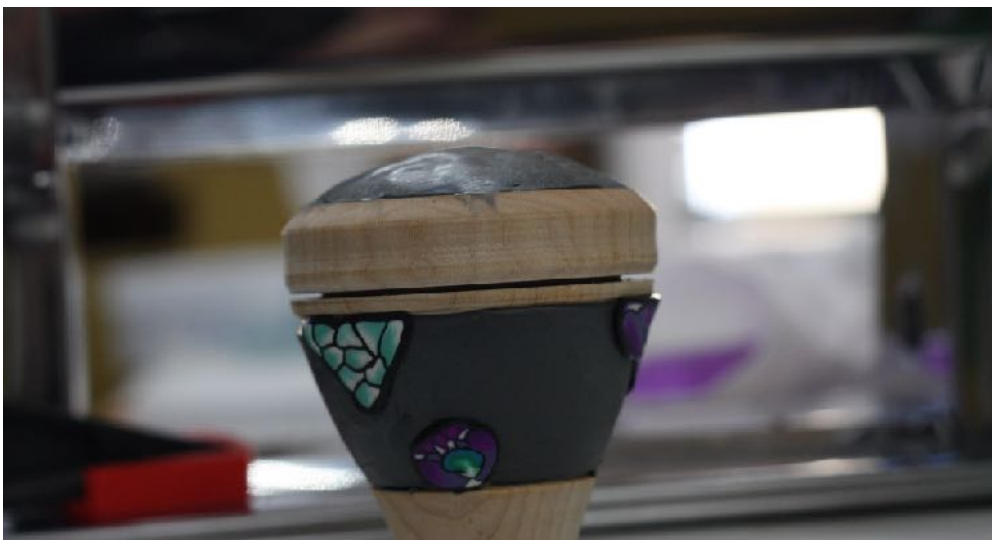
Wish I had been there to see all this and how it was done.. Looks far to complicated to me