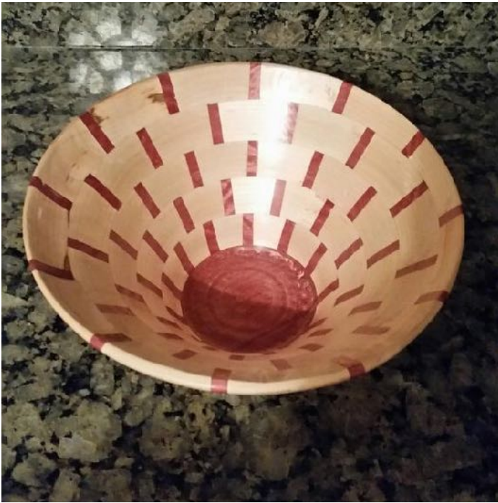
11 in segmented bowl,, purple heart and maple