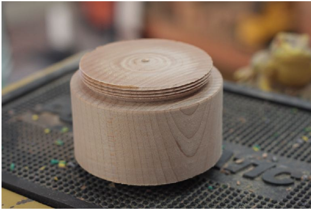
Those are some great threads that look to be perfect.