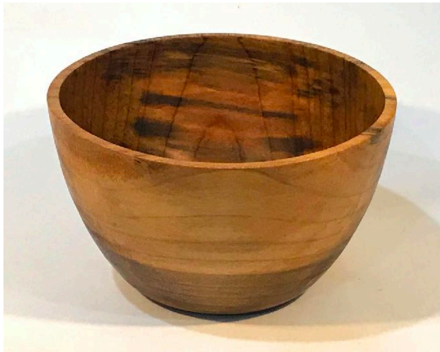
Magnolia, Watco Ext wood finish