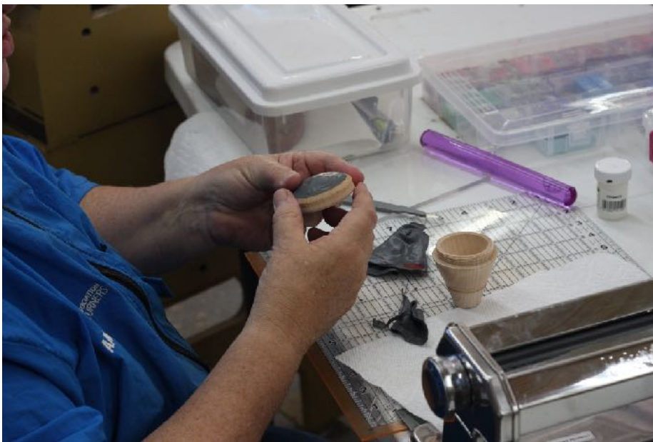
Pressing the clay top into place