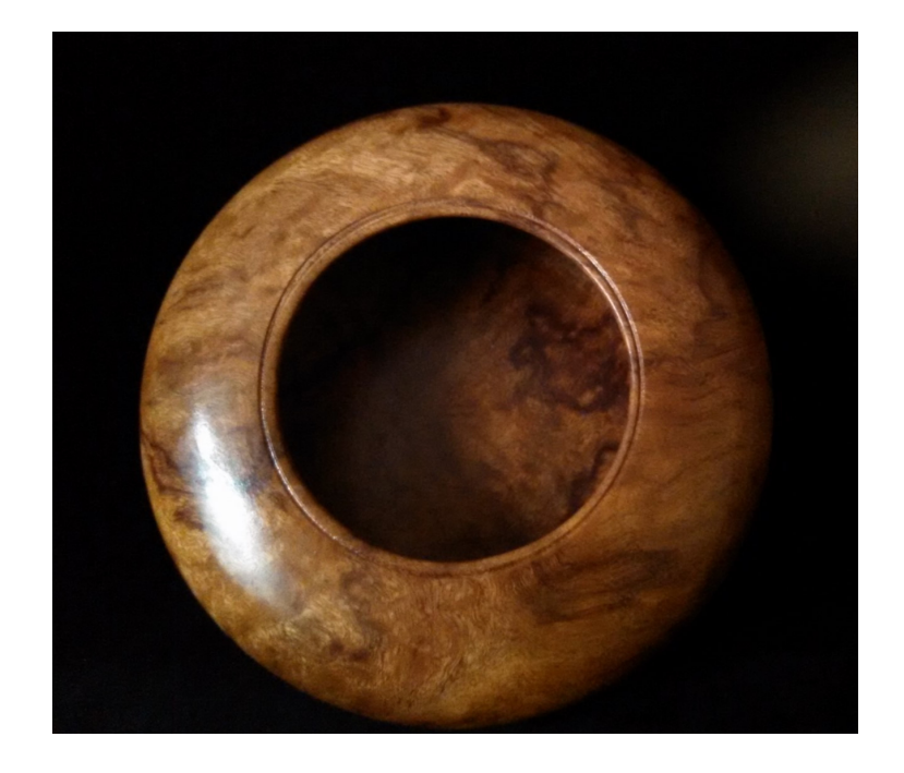
BARB HAHN'S Bowls LEFT