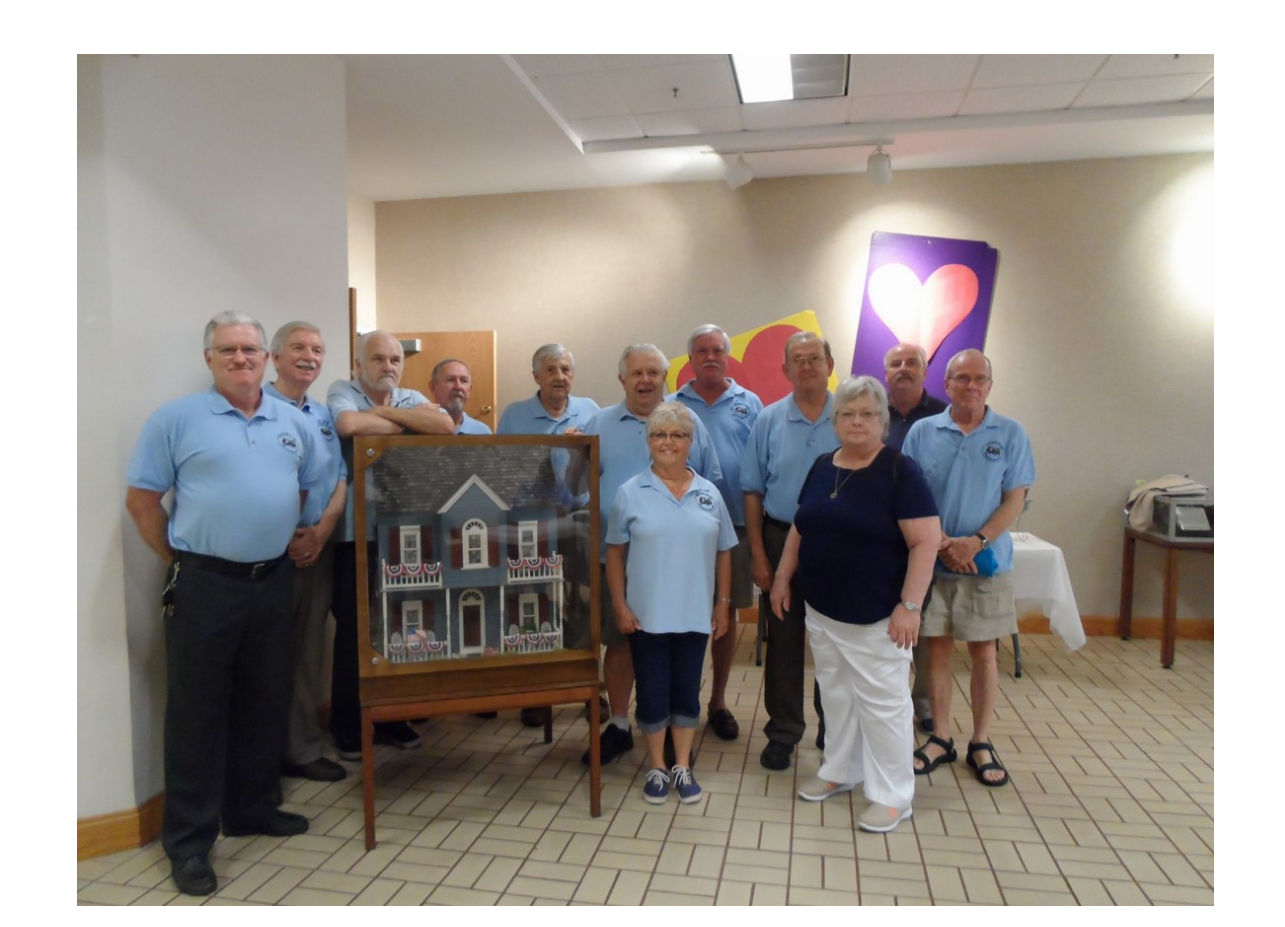
LIBRARY DOLLHOUSE CASE DEDICATION September 4, 2015