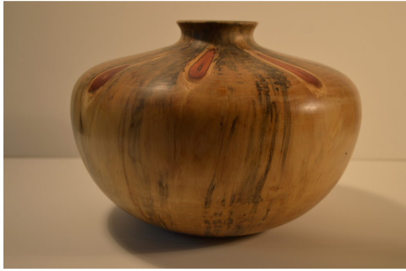
ROY YARGER Ming Vase II – Rainbow Poplar Norfolk Island Pine Hollow Vessel