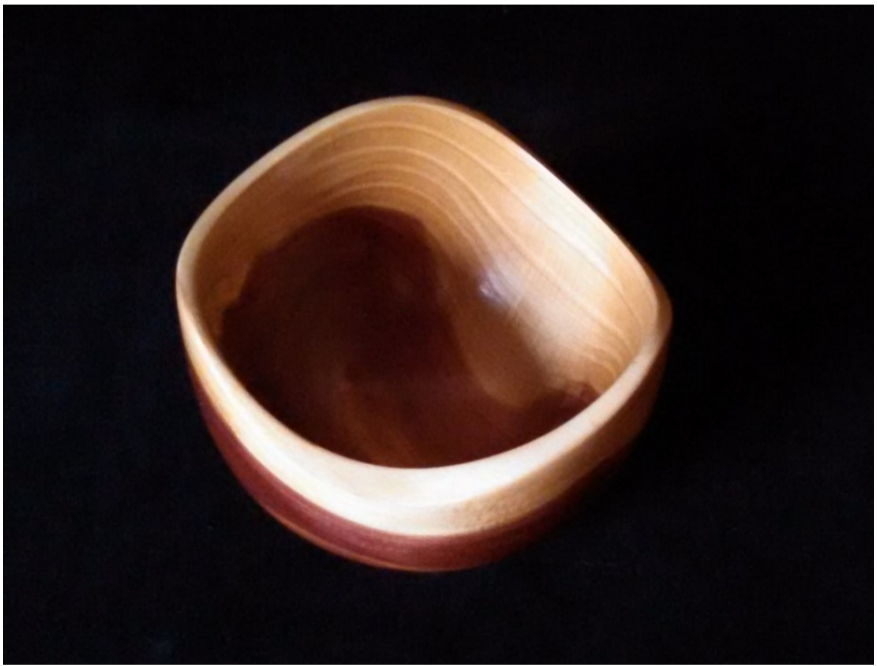
CHUCK JACKSON'S Natural Edge Bowl