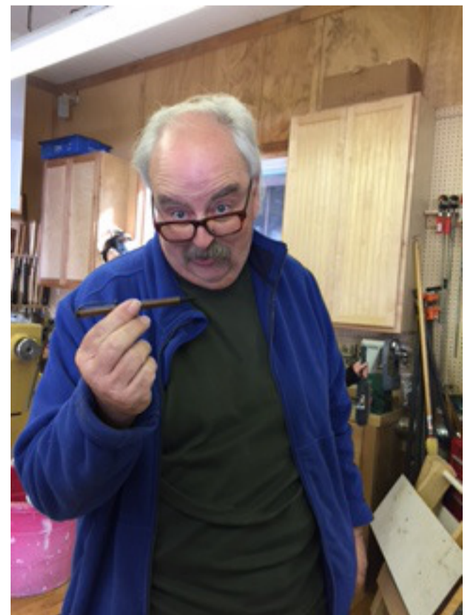
Illustration 7: Steve Posey's Finished Pen