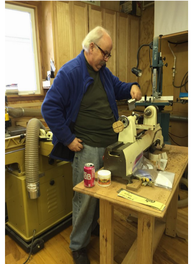
Illustration 1: Steve Posey