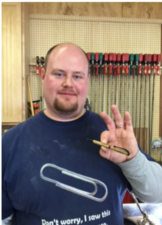
Illustration 8: Alan Wendel's Finished Pen