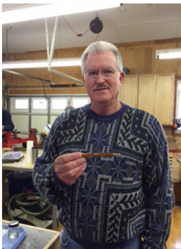
Illustration 9: Gerald Dukes' Finished Pen