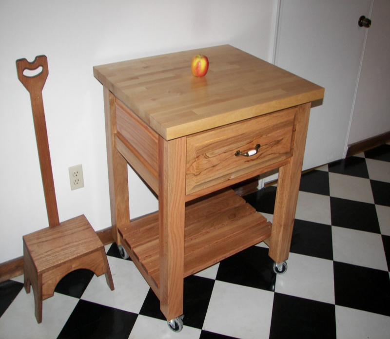
Jim Welch's Butcher Block Work Table and Step Stool