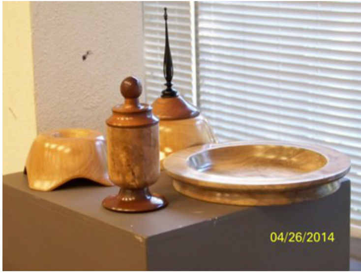
Larry Sullivan's Glynn Art Show Display