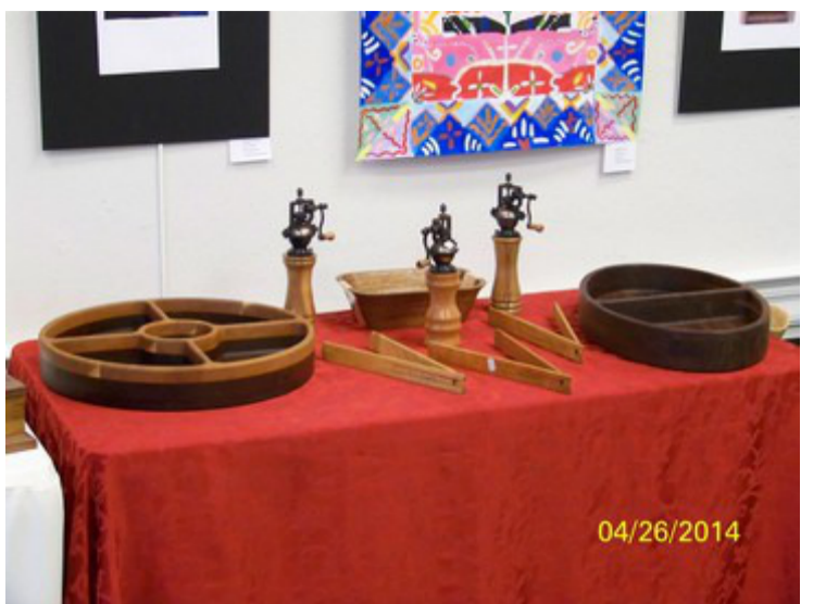
Norm Singleton's Glynn Art Show Display