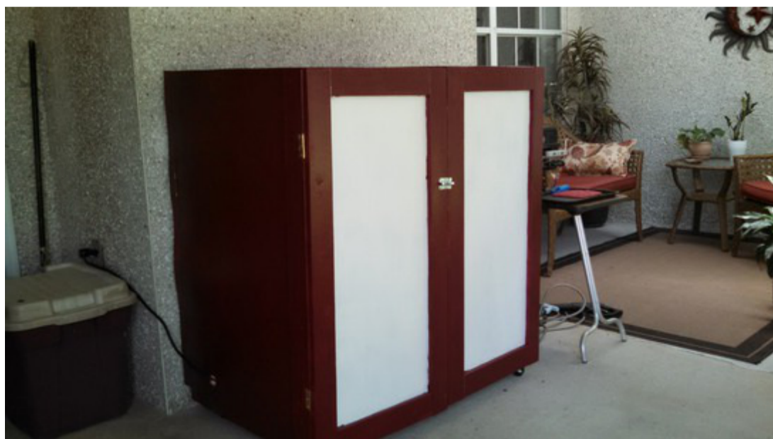
KAREN'S WOOD DRYING KILN