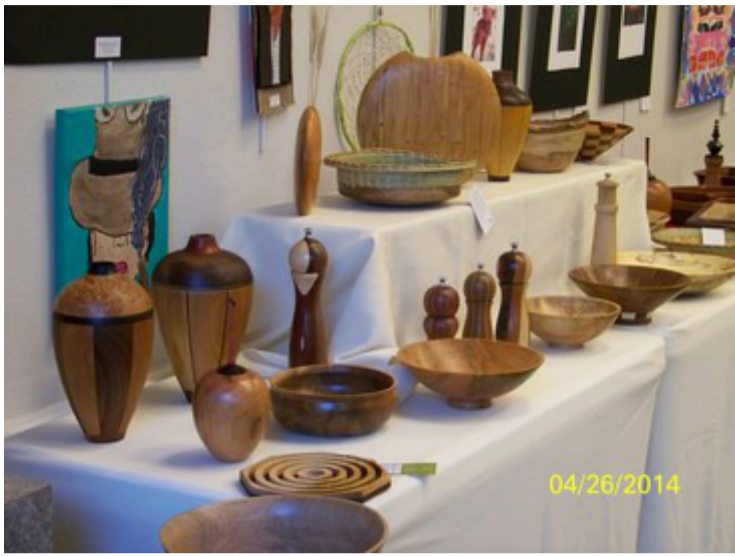
Roy Yarger's Glynn Art Show Display