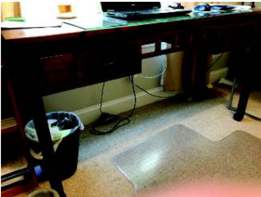
Beautiful solid black walnut desk