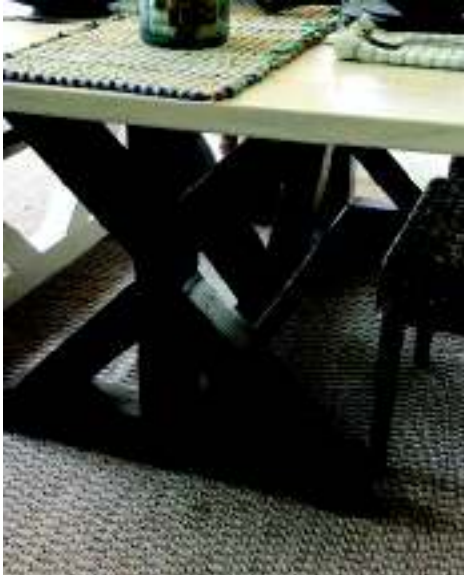
Farmhouse table with whitewashed top, breadboard ends and matching bench.