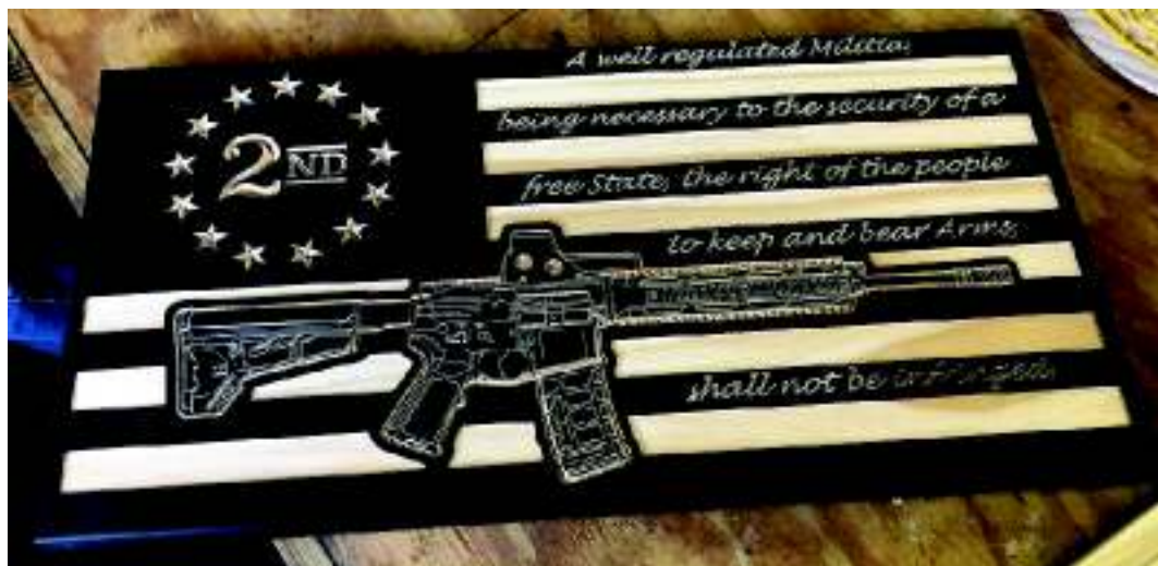
Eric talks about the flags he makes out of wood