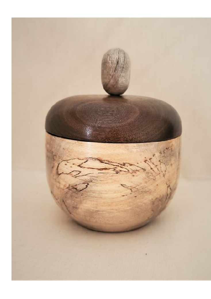
Maple and Stained Cherry