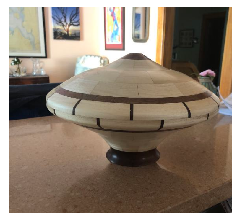
Poplar and walnut NASA wants it for Martian lander practice