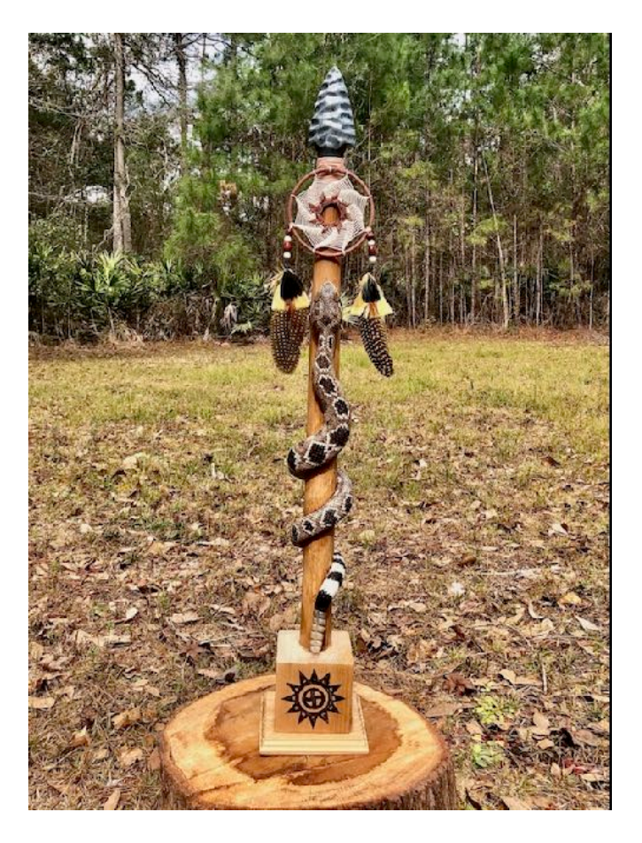
Western Diamondback Rattlesnake on Choctaw Indian Spear with handmade dreamcatcher