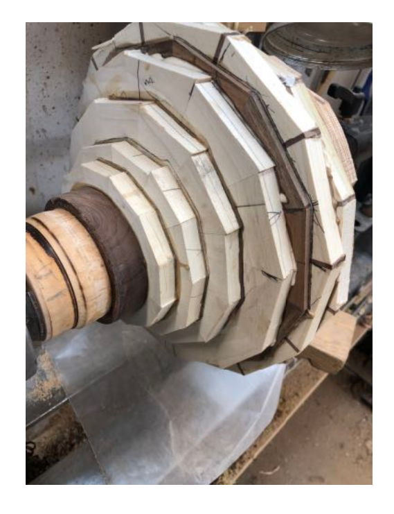
Second attempt at segments