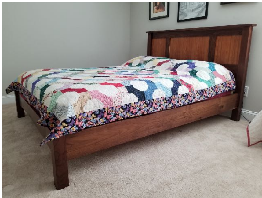
Walnut and cherry construction