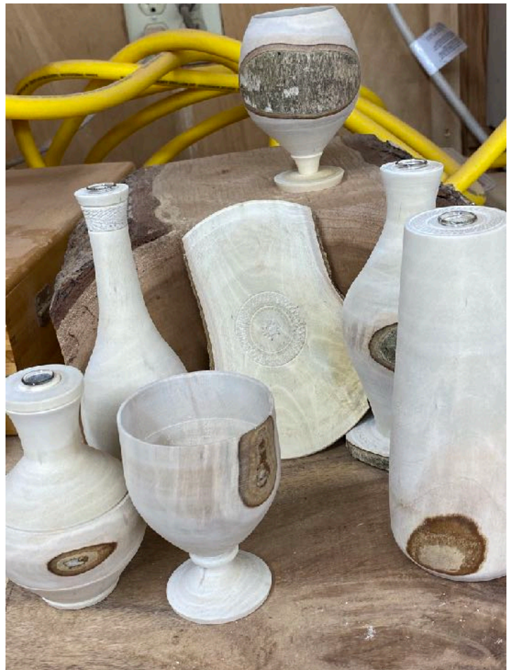
Geralds Holly made up of goblets and candle holders