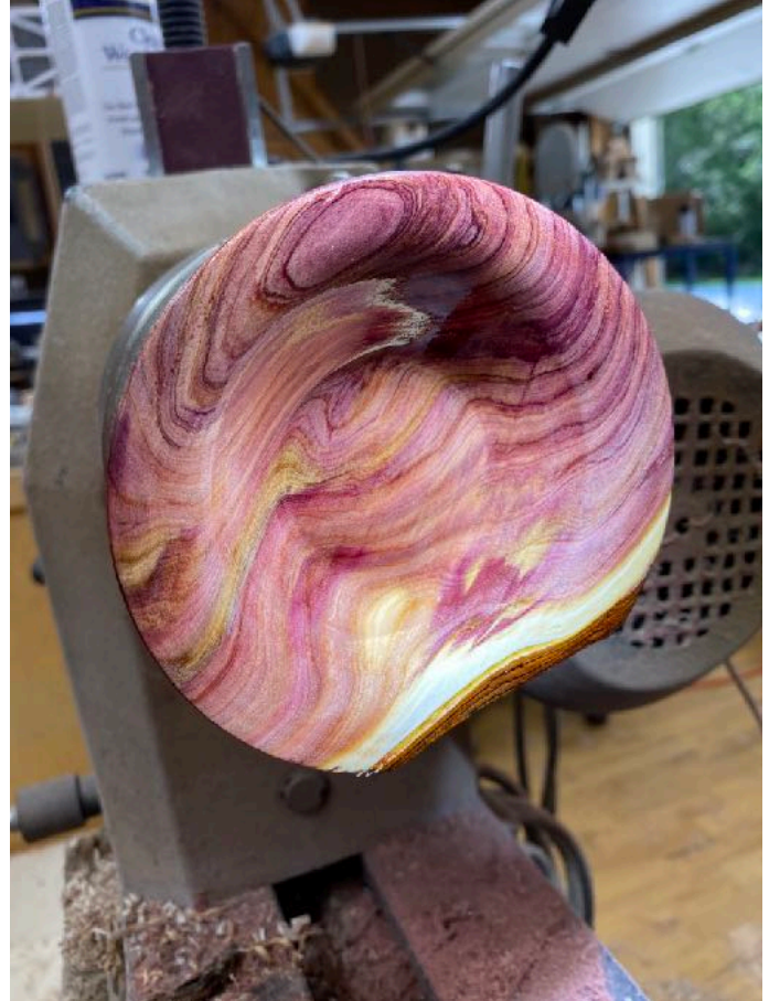
Cedar bowl unfinished