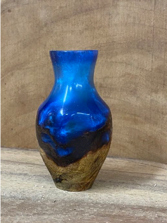
vase playing with color