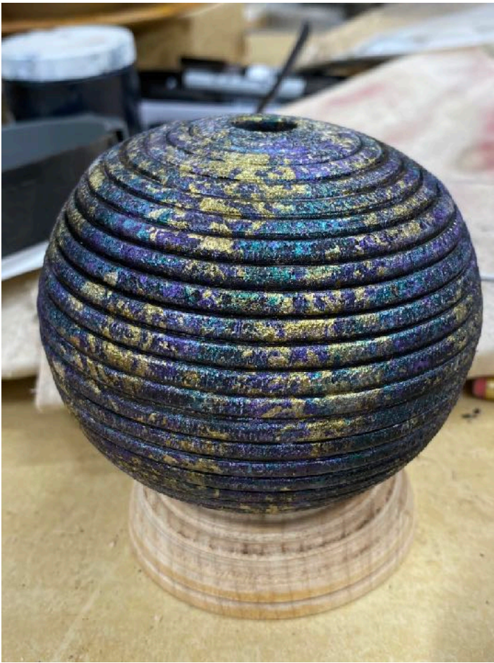
Hollow form messing with colors and texture