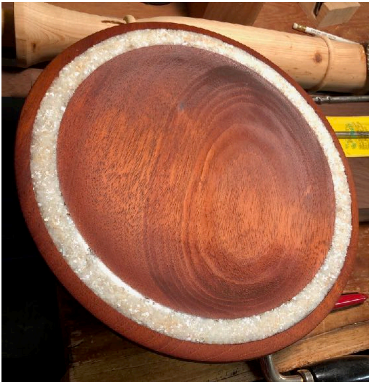
Mahogany with inlay of mother of pearl epoxied onto the edge. Very nice