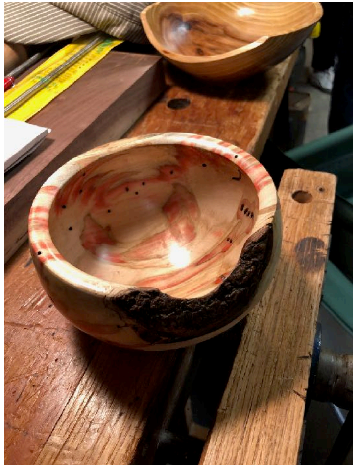
Flame Box Elder