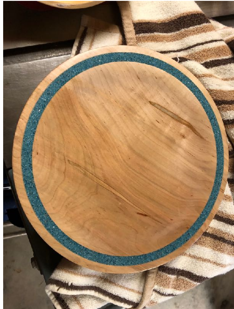
Opposite picture is turquoise inlay on maple