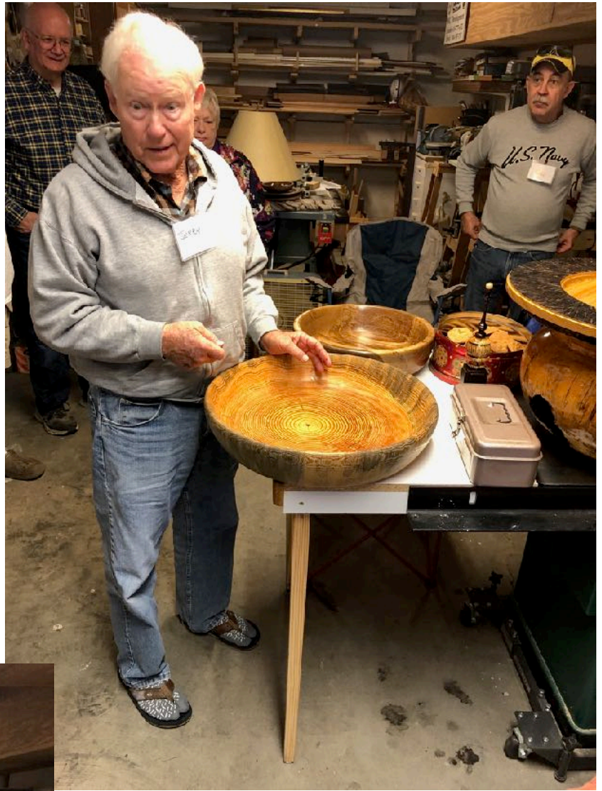
end grain pine