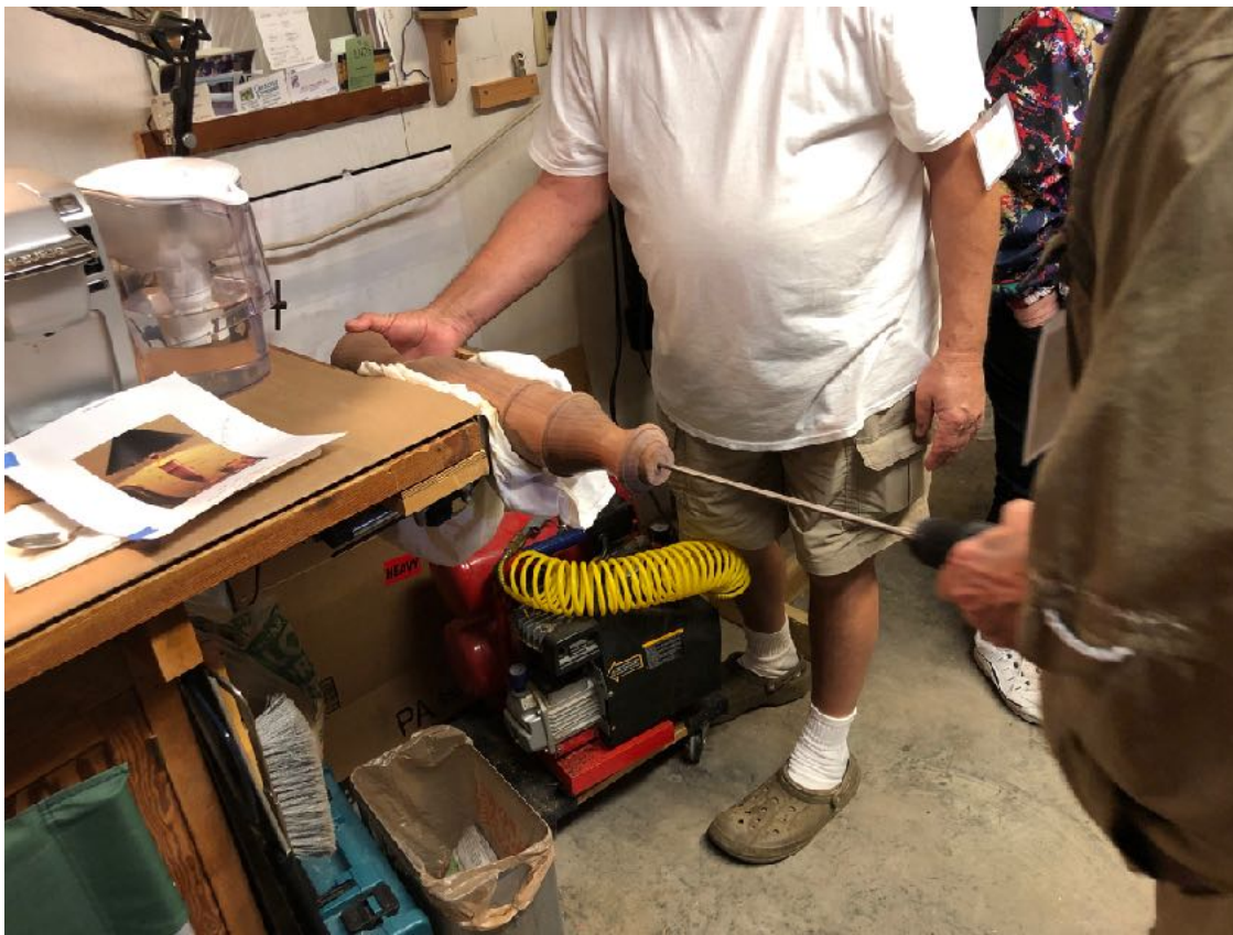
Then he used his electric drill bit. So much easier. Pictured below is the finished piece and another lamp