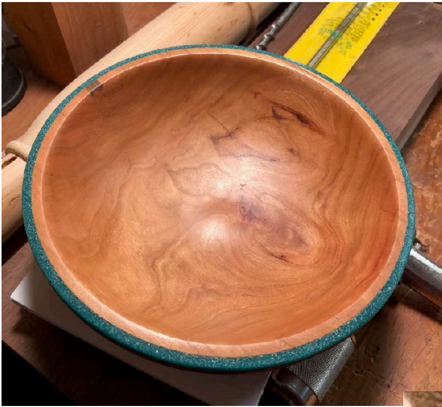
Cherry bowl with green colored epoxy laid over with SALT. WHOA,,, A neat idea