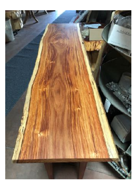
Jim just finished this beautiful Olive wood cocktail table from south of Rome, and a Solid Canary wood sofa table.