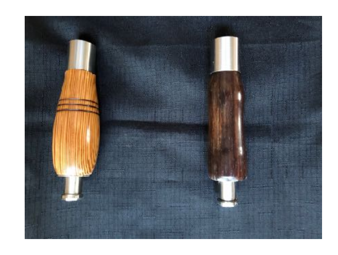
Salt and Pepper grinders. Heart pine and Bocote??