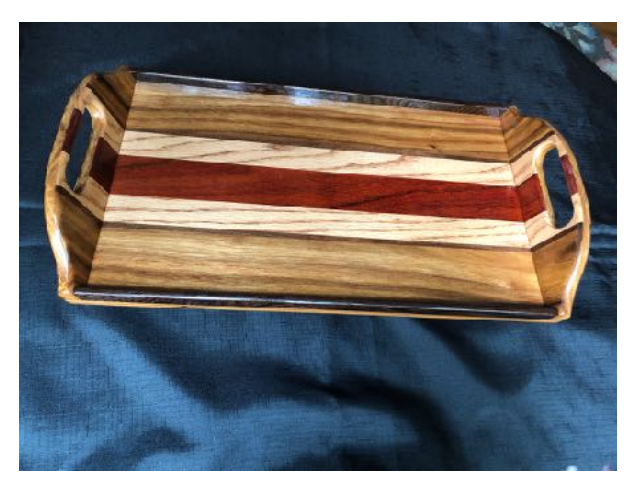
Tray 22" x 12" Canary wood, Walnut, Oak and Paduk