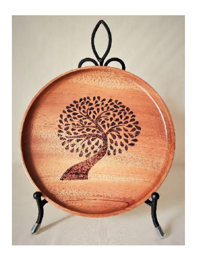
Pyro tree on Maple

Spalted Oak dish Does anyone see the guy on the plate. A test of your eyesight