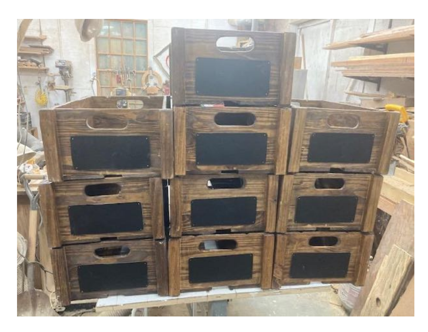
10 boxes for THE PORCH restaurant to hold their catering trays