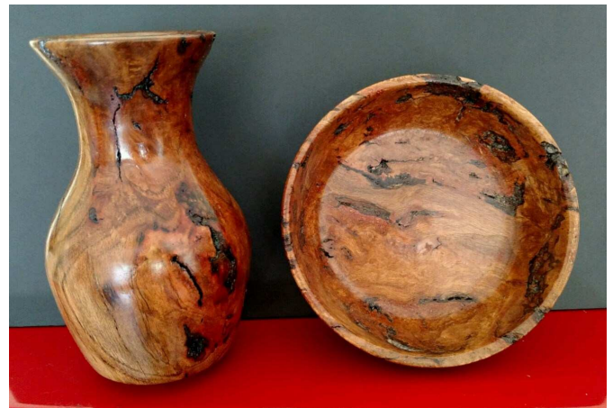
Alec Hay - Oak