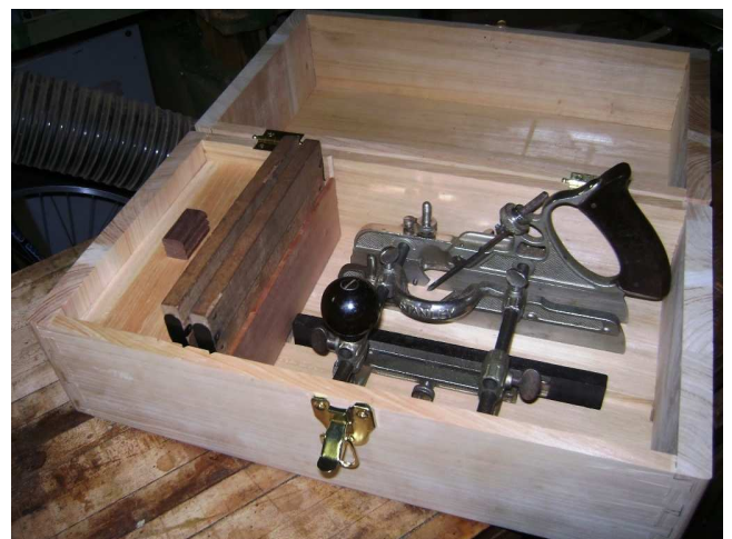
Paul – Cypress Tool Box for Vintage Plane