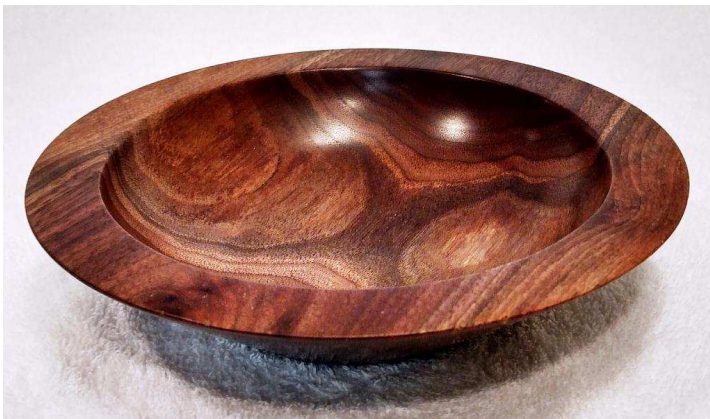
Herb - Walnut